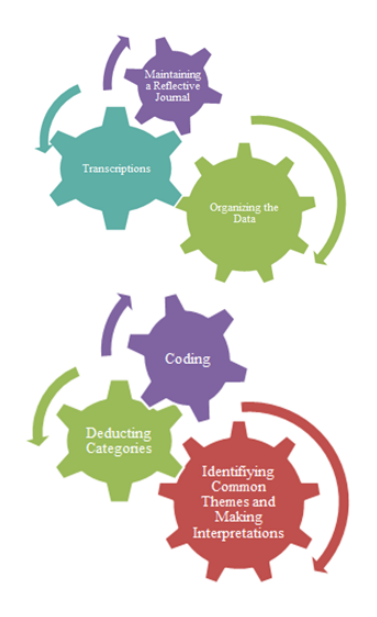
Figure 2. The Steps of This Phenomenological Investigation.

entire obtained material was read several times to gain familiarity. A research diary was kept during the data-collecting phase. The material recorded in the research diary helped the participants delve deeper into their responses. A diary was also kept while familiarizing the data. The data was discovered and analysed with the help of the information in the diary. The coding was done by printing out the decrypted data and colouring it with coloured pencils. Separate coding was done for each participant's decoding procedure, and then the notes were collected in the diary while choosing the codes based on how often they were utilized by comparing them to the codes of the other participants. The codes were examined regularly and continued until new codes could not be established. The category process was carried out from induction to the deduction phase after the coding phase was completed. When the categories reach saturation, the category creation process is completed. The data were analysed under three main issues to answer the research questions. These main topics are the sources of thought, for what purpose they use the sources of their thoughts and how their thoughts are affected in line with the aims. All coding and analyses made throughout the research were reviewed by the researcher, an expert in this field. Figure 2 illustrates the steps of this phenomenological investigation.